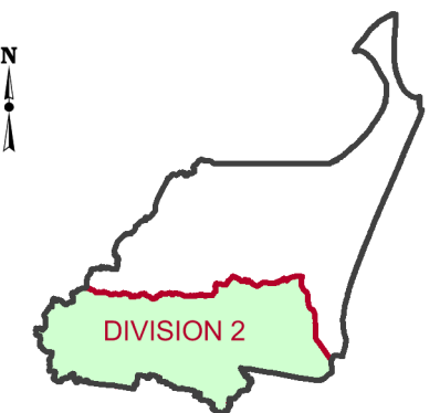
DIVISION 2 Location Map